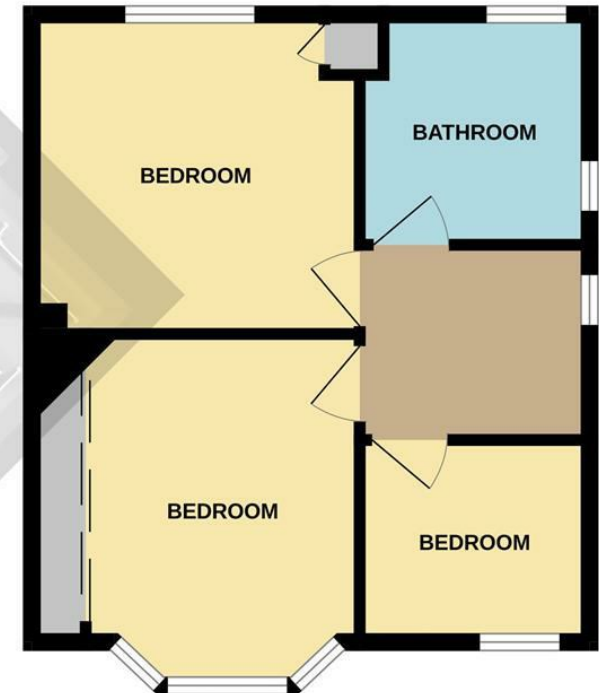
1ST FLOOR 388 sq.ft. (36.0 sq.m.) approx.